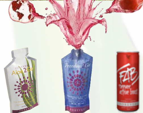
Aloe2Go and Freedom2Go – bursting with the best, ready to go with you wherever you go.