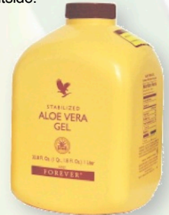
Forever Aloe Vera Gel: great for children and animals

They come flavoured with orange and grape, and are formulated without sugar, aspartame, artificial colours or preservatives so you can look after your growing youngsters from the inside as well as the outside.