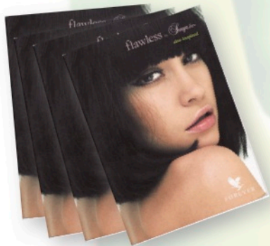
Flawless by Sonya

Published by Wacky Cactus Publications. © Copyright Wacky Cactus Publications. No reproduction in whole or in part without written permission. No product or service advertised and/or published and/or appearing in the Wacky Cactus newsletter is, unless expressly stated to the contrary, endorsed by and/or otherwise associated with the Wacky Cactus brand.